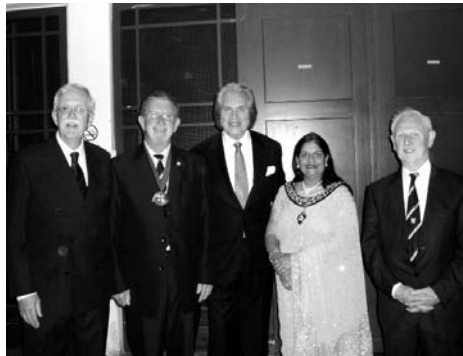
Engelbert Humperdinck on receiving the Honorary Freedom of Leicester.